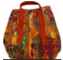
Click To View Sample

You can never have too many bags! Let's create great looking bags using machine quilting, free motion embroidery and couching techniques. Intermediate sewing skills required. SUPPLY LIST. 2, 3 sessions. $79